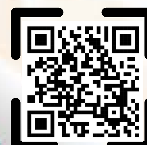
Diagram 3: QR code to enter the course