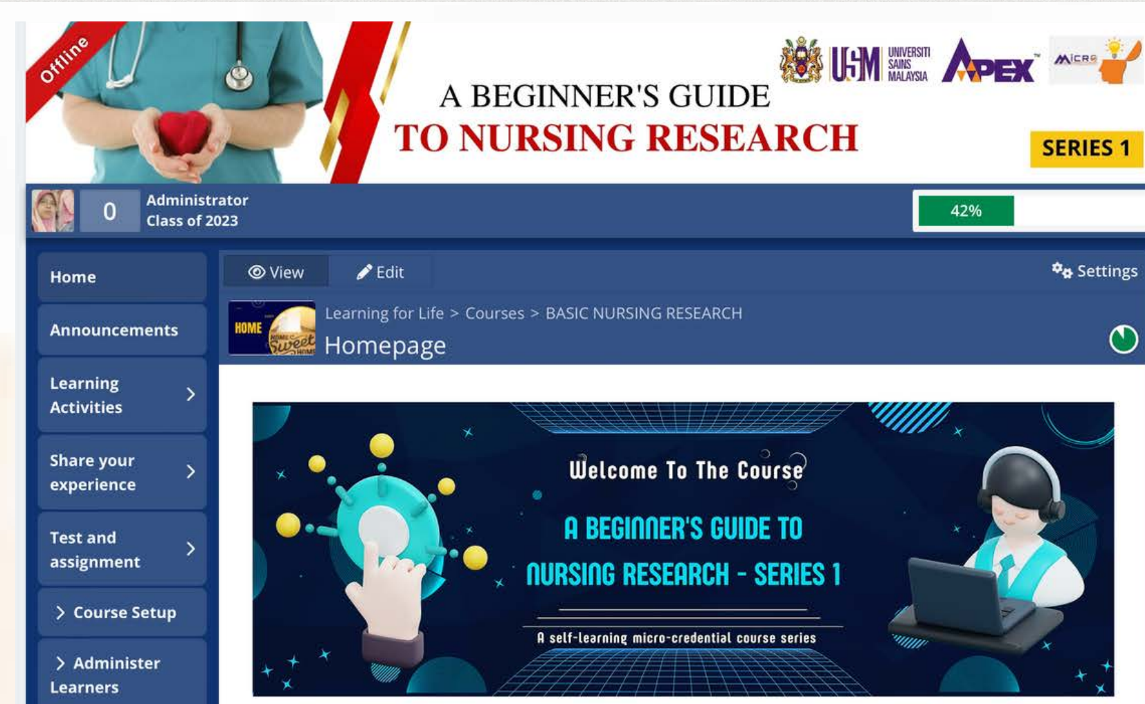
Diagram 2: Course Home Page in learning4life.usm.my

As this course is published online in the Open Learning (OL) platform (learning4life.usm.my) and in English version, it can reach thousands of nurses, educators, nurse managers, and nursing students in Malaysia and worldwide. The user-friendly registration and the easy payment methods provided by the Open Learning platform also assist the learners to sign up for the course easily.